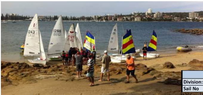
Meanwhile ... normal Saturday training at MYC

MYC Juniors provides coaching and racing experience and develops kids from beginners to racing ability. It runs on Saturday afternoons of school Terms 4 and 1. It is run by sailing instructors and parent volunteers.