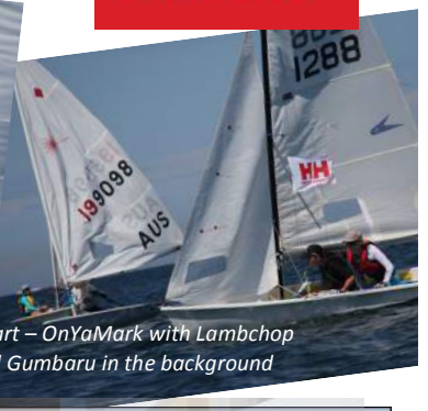
Prestart – OnYaMark with Lambchop and Gumbaru in the background